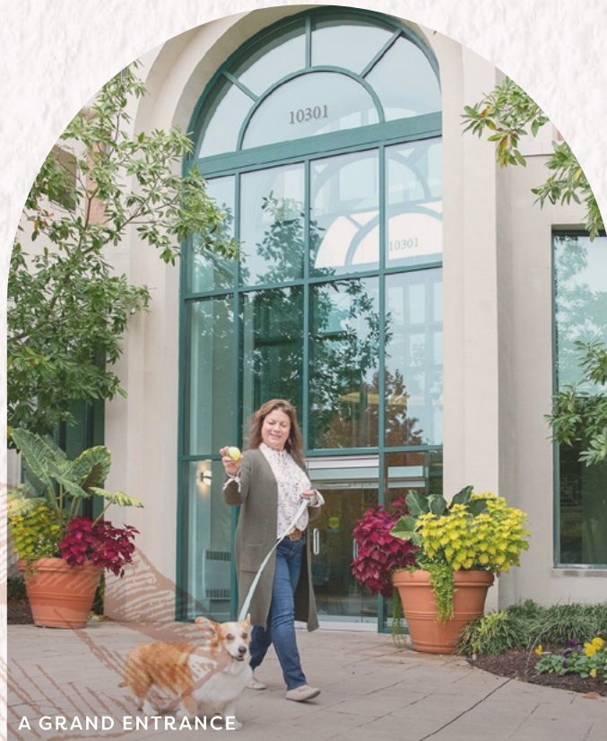
A GRAND ENTRANCE