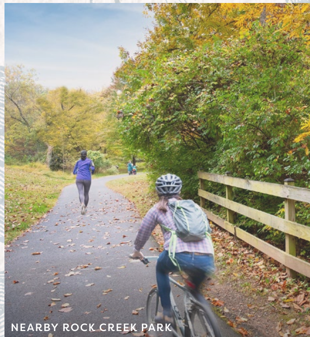
NEARBY ROCK CREEK PARK