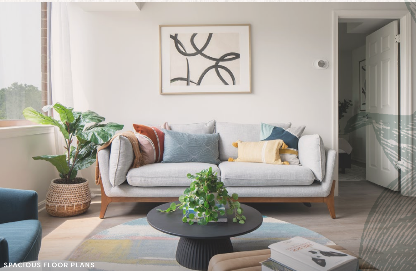
SPACIOUS FLOOR PLANS

Imagine waking up in an alcove of tranquility, fully refreshed. Stepping out onto your private balcony to take in the tree-canopied urban skyline. The day begins to unfold before you. Will you stay in for a self-care sabbatical? Whip up a spread for a soirée under the stars? The luxury of leisure is yours.