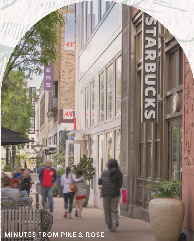
MINUTES FROM PIKE & ROSE

North Bethesda is a prime location for urban sophistication, and you are at the center of it. In under 10 minutes, you can stroll over to Strathmore to enjoy a picnic and a Live on the Lawn concert. Or drive to Pike & Rose for eclectic eats and designer drinks. Where will you go from here?