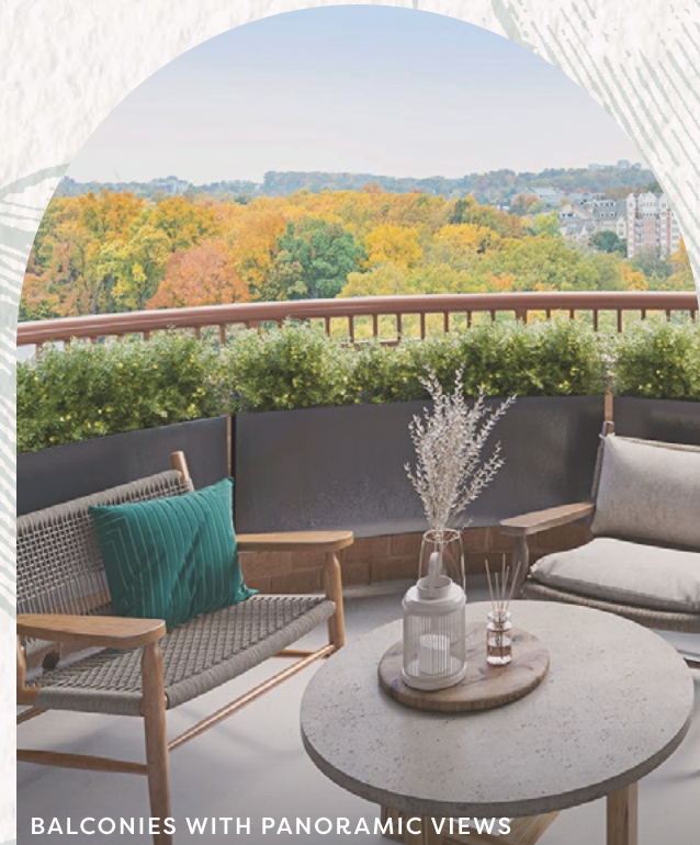
BALCONIES WITH PANORAMIC VIEWS