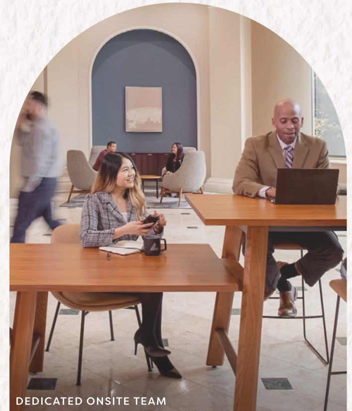
DEDICATED ONSITE TEAM