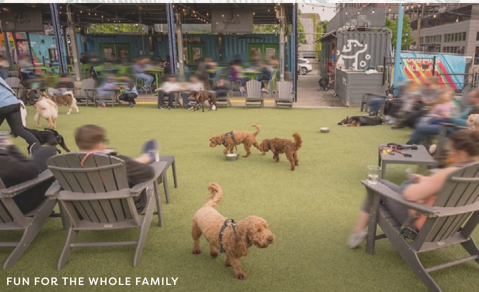
FUN FOR THE WHOLE FAMILY